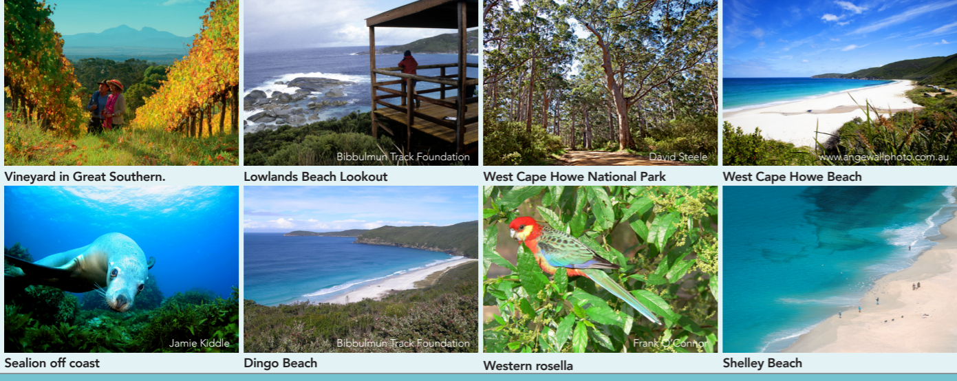
Vineyard in Great Southern, Lowlands Beach Lookout, Bibbulmun Track Foundation, West Cape Howe National Park, West Cape Howe Beach, Sealion off coast, Dingo Beach, Bibbulmun Track Foundation, Western rosella, Shelley Beach

These are natural granite fissures which create noisy geyser - best viewed when the tides are high and the wind is strong.