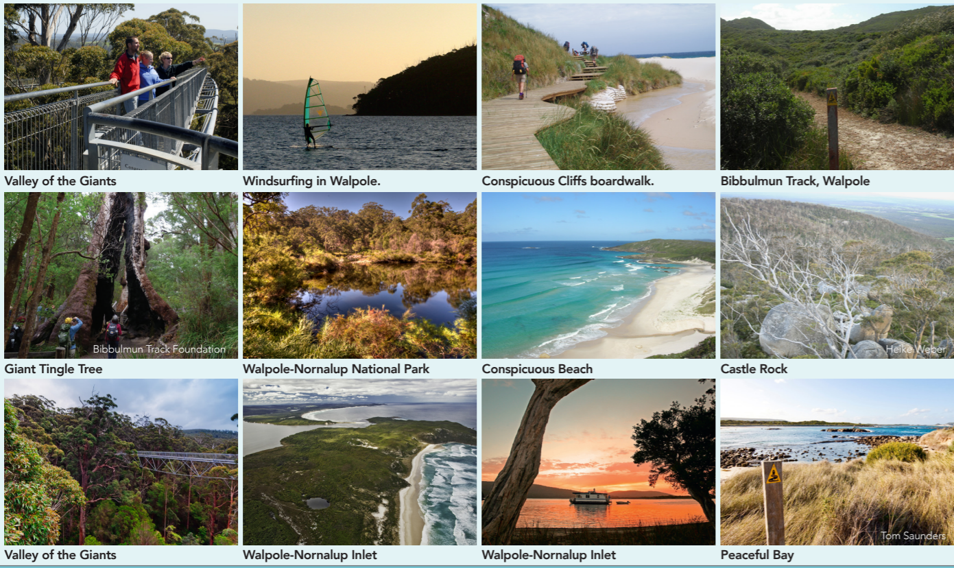
Valley of the Giants, Windsurfing in Walpole, Conspicuous Cliffs boardwalk, Bibbulmun Track, Walpole, Giant Tangle Tree, Walpole-Nornalup National Park, Conspicuous Beach, Castle Rock, Valley of the Giants, Walpole-Nornalup Inlet, Walpole-Nornalup Inlet, Peaceful Bay

Experience award-winning wines at the cellar door 9759 1366