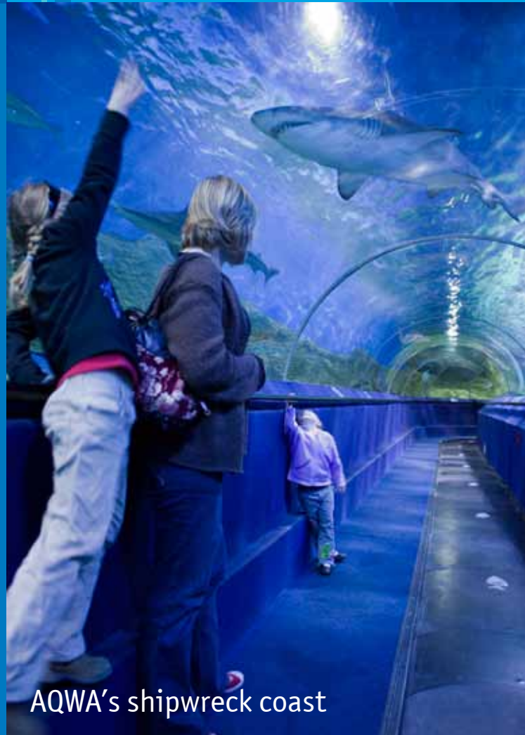
AQWA's shipwreck coast