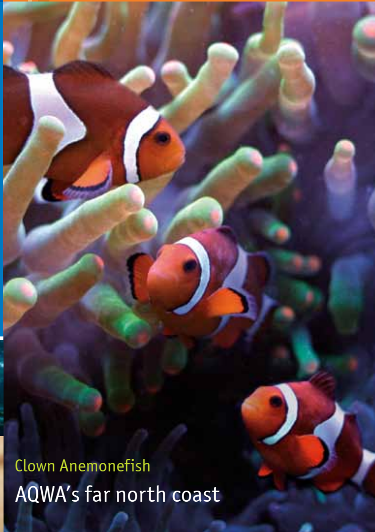
Clown Anemonefish AQWA's far north coast

For specific directions from your current location download the free AQWA app to your smart phone or tablet.