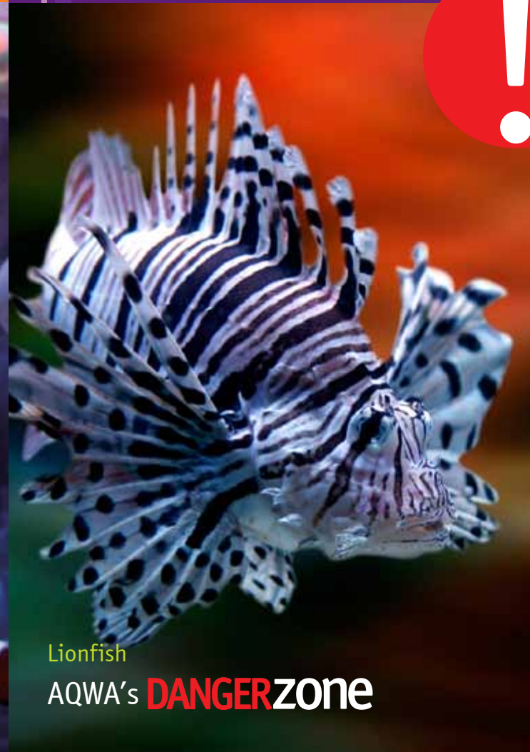
Lionfish AQWA's DANGERzone