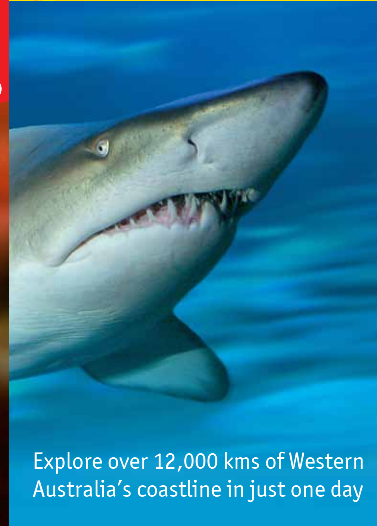
Explore over 12,000 kms of Western Australia's coastline in just one day